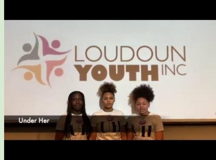
Project: Promotion video for Loudoun Youth Inc.